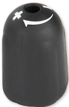
2-Shot Knob - Graphics Molded In

Ready to see how Rogan can move you? Whatever your product may be, Rogan is dedicated to helping you create the perfect knob.