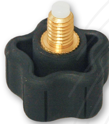
Custom Stud with Nylon Top

“ By carrying a wide range of standard sizes and configurations, we simplify the process of choosing the best knob for your needs ”