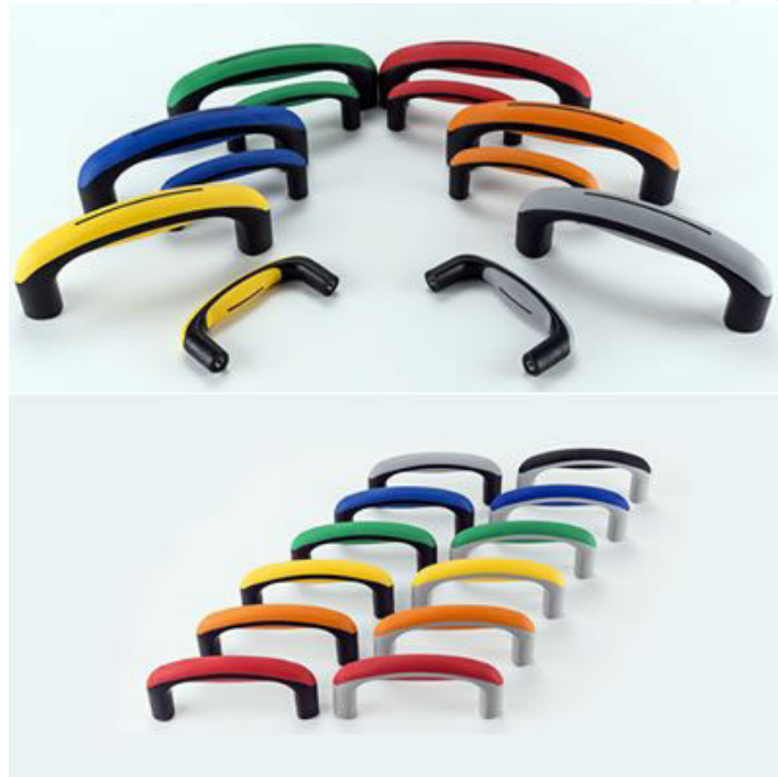
Pull Handles - Multiple Colors

We believe that a simple knob is so much more than just a knob, especially when it's on your product. This is why we will always go to great lengths to create the perfect, functional solution for you.